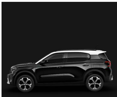
Perla Nera Black (metallic)