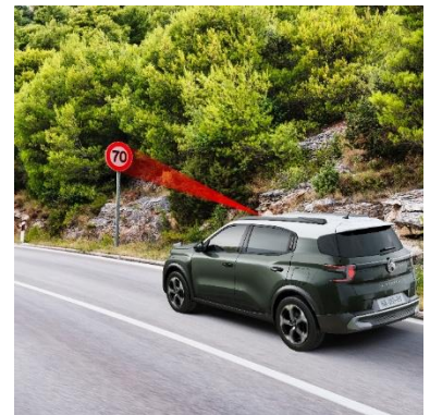
Speed Limit recognition and recommendation