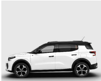
Polar White (solid)