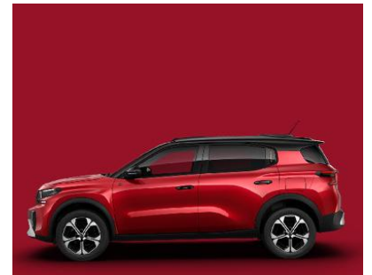
Elixir Red (metallic)