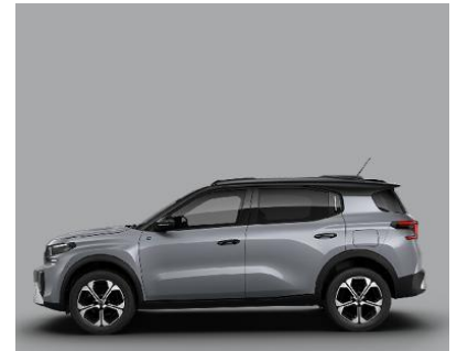
Mercury Grey (metallic)