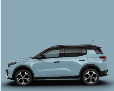
Monte Carlo Blue (solid)