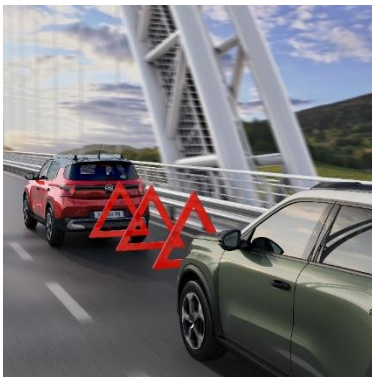
Camera Based Active Safety Brake