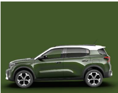
Bright Blue (metallic)