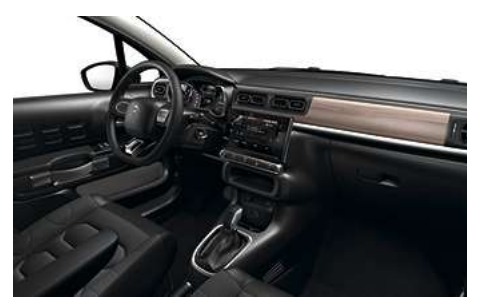
TECHWOOD AMBIANCE (Standard on Flair Plus, optional on Flair)

STANDARD AMBIANCE (Standard on Feel and Flair)